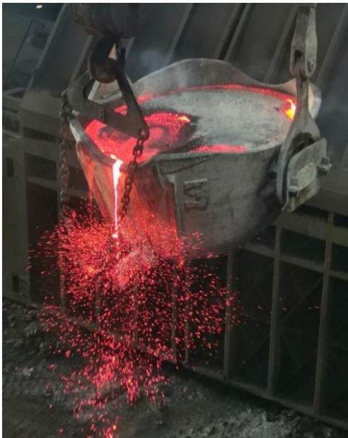
Fig. 1 Raw copper smelting in a blast furnace

https://www.reak.info/en/projectoverview.html