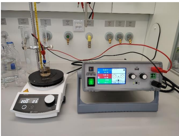
Fig. 3 Setup of an electrochemical oxidation test: diamond electrodes in sulfuric acid arsenic(III) oxide solution